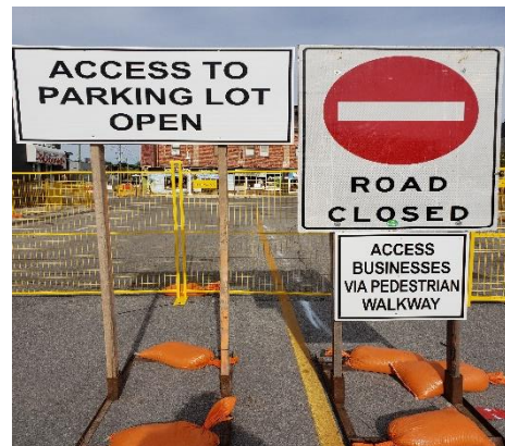
Figure 3 – Proposed Signage at Hoarding Fencing