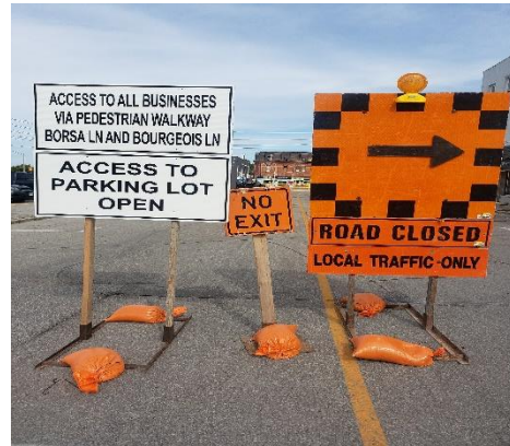
Figure 2 – Proposed Signage Located at Closure Limits