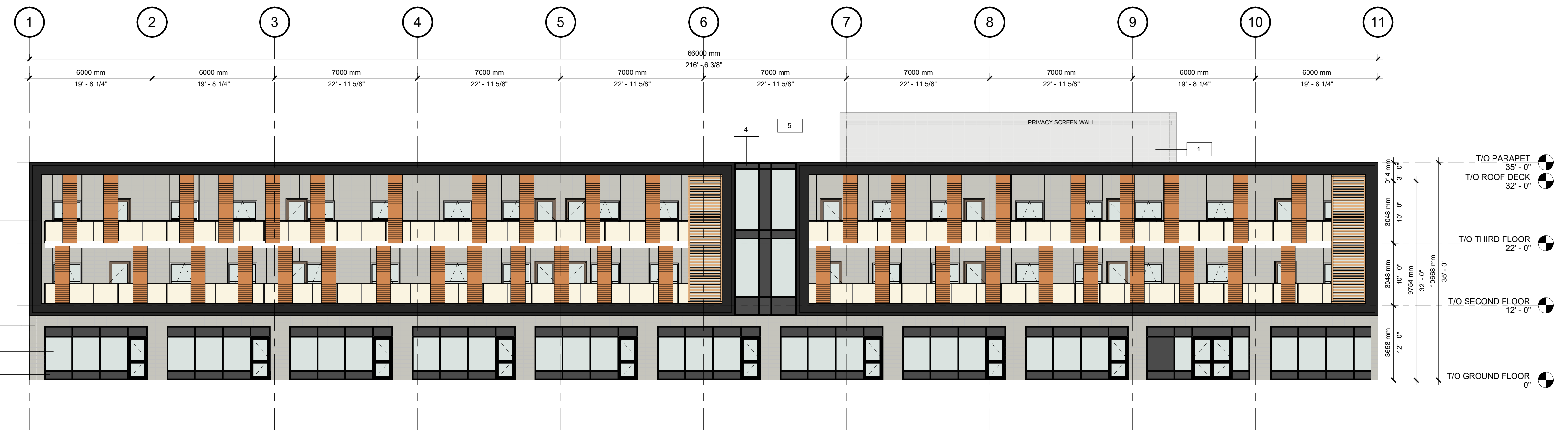
2 SOUTH ELEVATION 1" = 10'-0"

C:\Users\shkerm\Documents\122055-Balm Beach Commercial and Residential_BUILDING_C_122055-NPPT.dwg 8/23/2023 11:57:36 AM