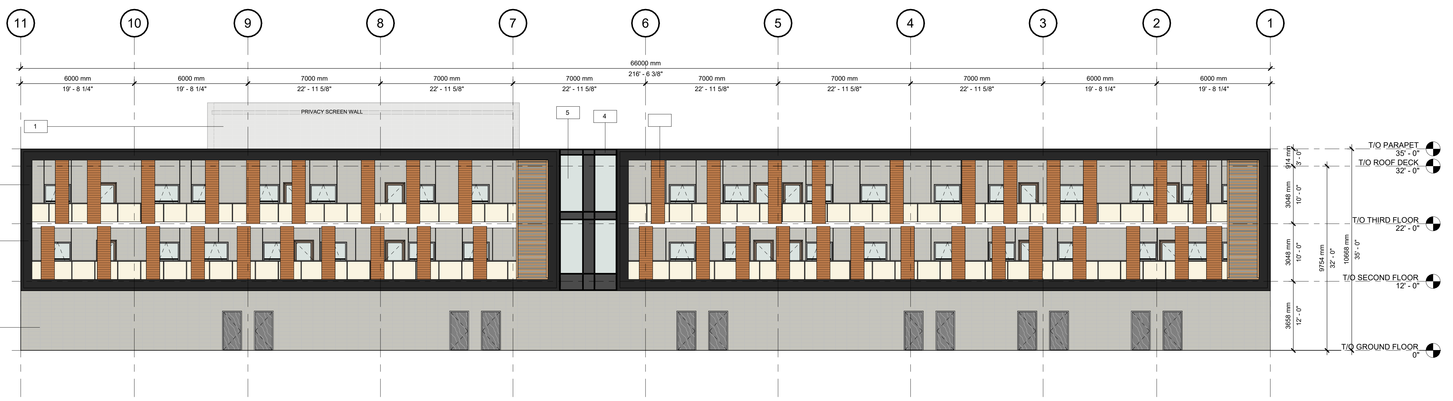
1 NORTH ELEVATION 1" = 10'-0"