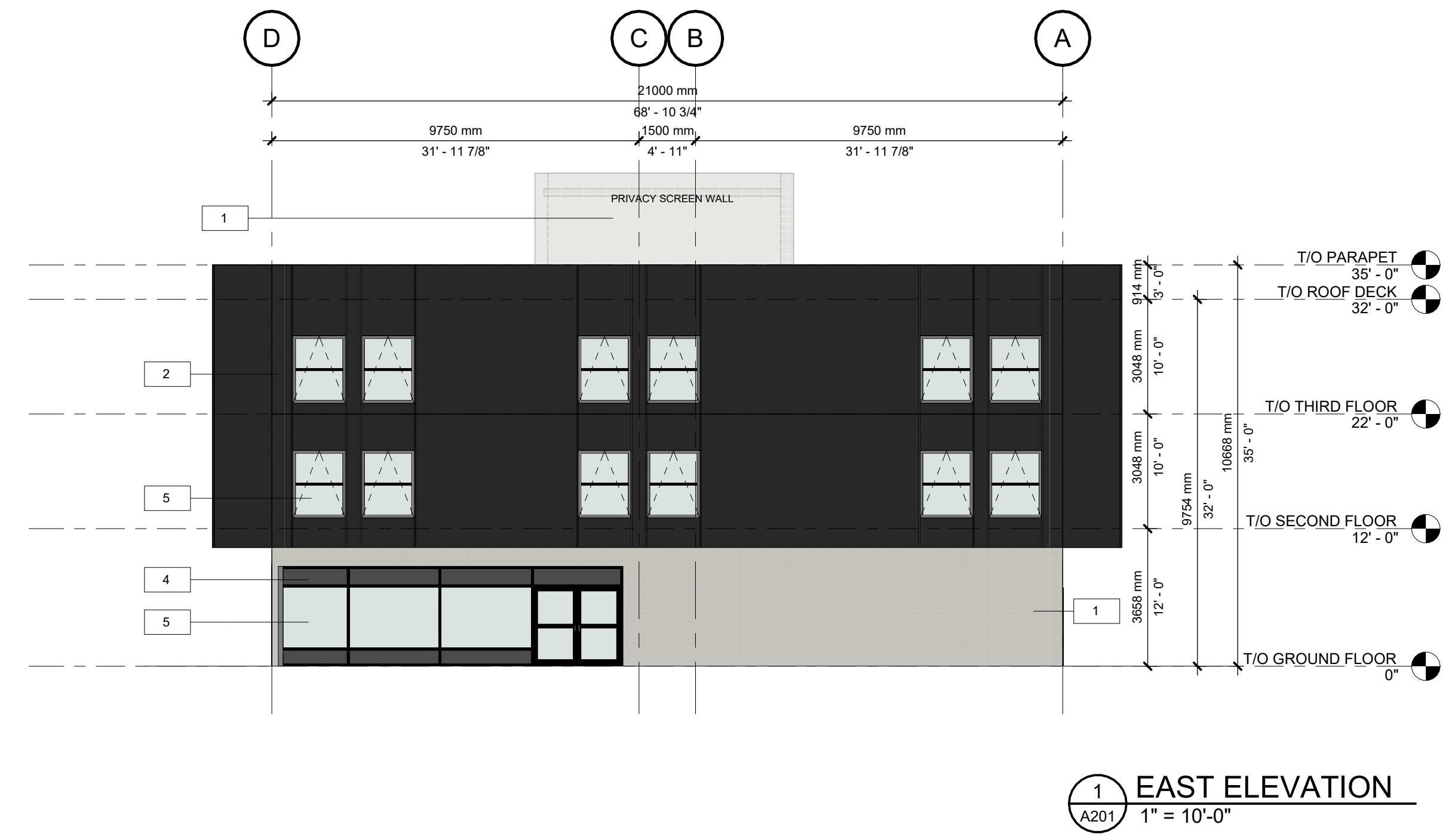
1 EAST ELEVATION A201 1" = 10'-0"

DO NOT SCALE DRAWINGS. USE ONLY DRAWINGS MARKED "ISSUED FOR CONSTRUCTION". VERIFY CONFIGURATIONS AND DIMENSIONS ON SITE BEFORE BEGINNING WORK. NOTIFY ARCHITECT IMMEDIATELY OF ANY ERRORS, OMISSIONS OR DISCREPANCIES.