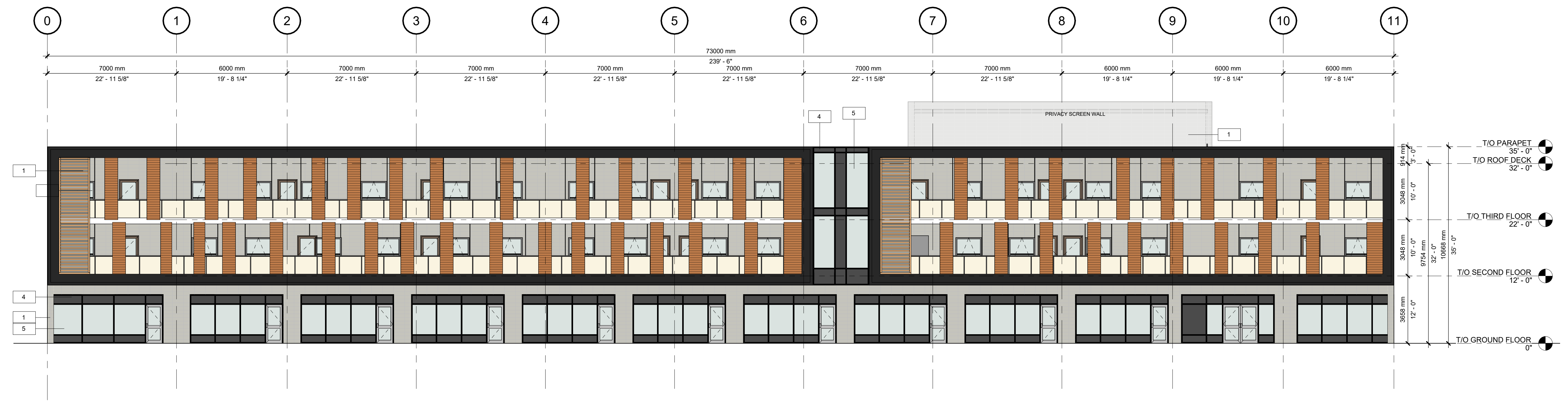
2 SOUTH ELEVATION A202 1" = 10'-0"

DO NOT SCALE DRAWINGS. USE ONLY DRAWINGS MARKED "ISSUED FOR CONSTRUCTION". VERIFY CONFIGURATIONS AND DIMENSIONS ON SITE BEFORE BEGINNING WORK. NOTIFY ARCHITECT IMMEDIATELY OF ANY ERRORS, OMISSIONS OR DISCREPANCIES. CHAMBERLAIN ARCHITECT SERVICES LIMITED AND CHAMBERLAIN CONSTRUCTION SERVICES LIMITED HAVE SIMILAR OWNERSHIP. CHAMBERLAIN ARCHITECT SERVICES LIMITED HAS COPYRIGHT. CONSTRUCTING A SUBSTANTIALLY SIMILAR BUILDING WITHOUT PERMISSION MAY INFRINGE THE COPYRIGHT OWNER'S RIGHTS. MAKING MINOR CHANGES TO PLANS DOES NOT NECESSARILY AVOID COPYRIGHT INFRINGEMENT. INNOCENT INFRINGEMENT IS NOT A DEFENSE TO COPYRIGHT INFRINGEMENT. ©