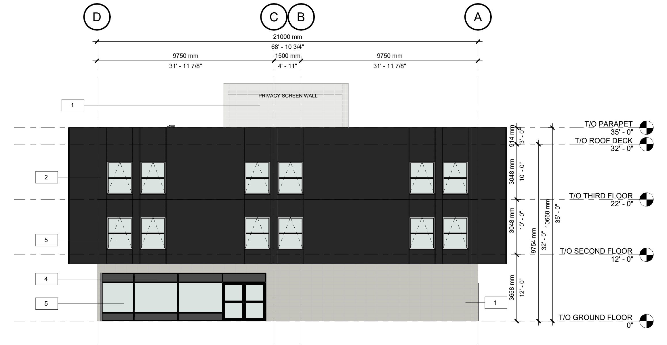
1 EAST ELEVATION A201 1" = 10'-0"