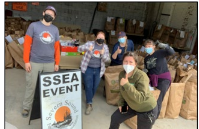
Curbside Tree Distribution

Also online: https://bit.ly/sseapollinator