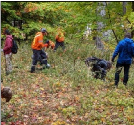
Students planting at Little Lake Park