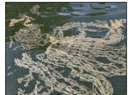
Blue Green Algae Monitoring