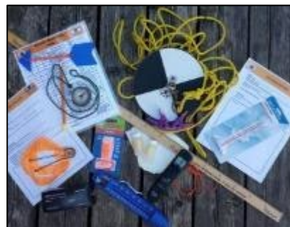
Citizen Science Monitoring