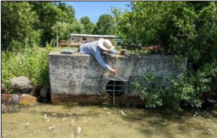
Measuring Little Lake water levels