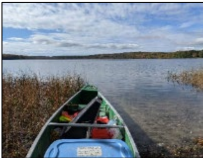
Little Lake Monitoring